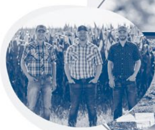
Peterson Farm Bros.