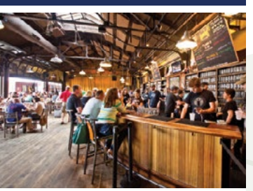
Beer City USA. 50 amazing craft breweries on the Beer City Ale Trail.