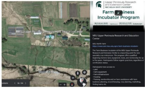
A typical listing includes a map of the location, a video, website link, resource description and a listing of programs that may be useful for beginning farmers