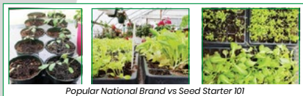
Popular National Brand vs Seed Starter 101

For healthy plants, you need to start with healthy soils.